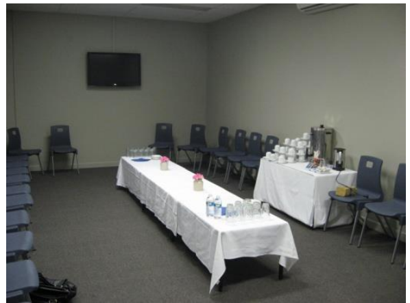
Meeting Room 2