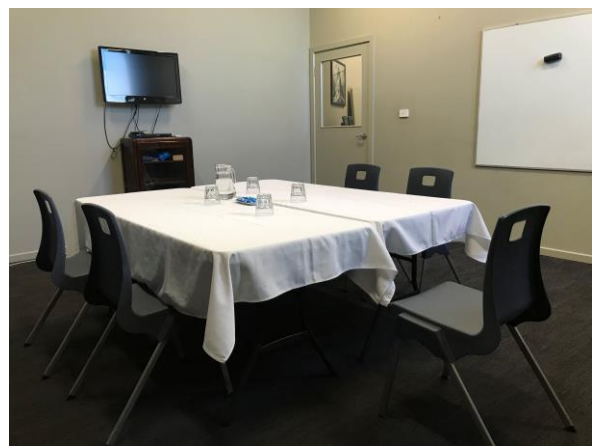
Training Room/Board Room