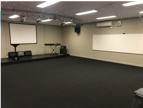
Meeting Rm 1 -Small Aud.

Suitable for 15 theatre style seating or 12 at training tables. Seating on high quality ergonomically designed chairs. White Board. Carpeted floor. 42 inch flat screen television with screen display tech support for DVD; Digital Television; Fully Air-Conditioned.