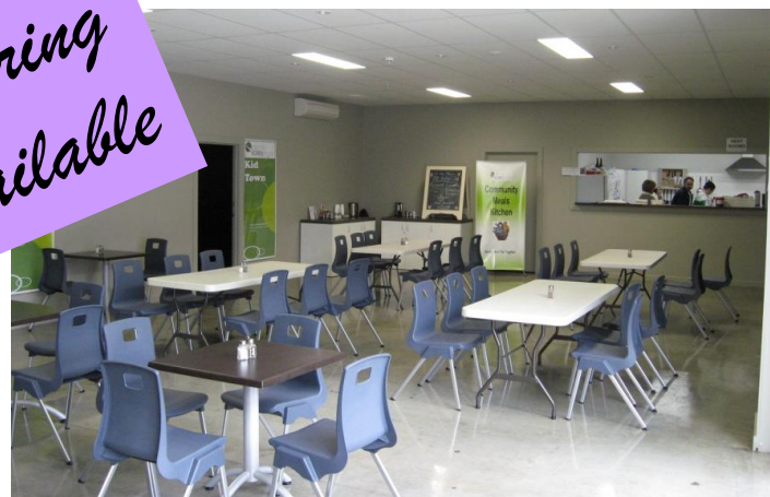
Hard Floor Multi-Purpose Room